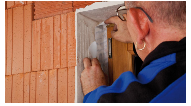
5. Stick to the reveal

Start applying the tape in the corner area. First position approx. 2 cm (7/8") of the tape on the horizontal part of the frame and stick the adhesive strip to the frame. Guide the tape around the frame corner and stick the tape to the vertical part of the frame. Gradually remove the release film while doing so.