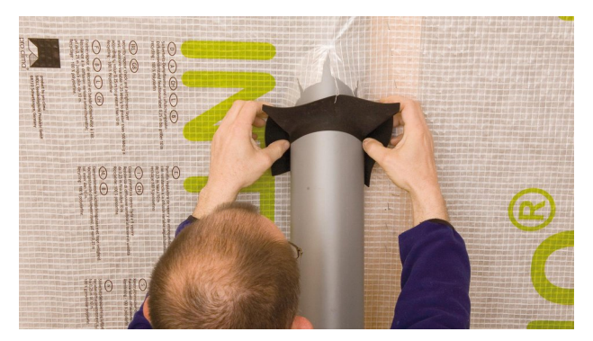
1. Pull the grommet over the pipe and align it Select a grommet to match the diameter of the pipe, pull it over the pipe, guide it as far as the subsurface and align it.